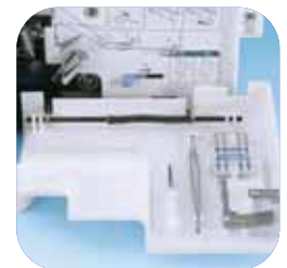
Built-in accessory storage