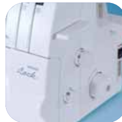
Easy access controls