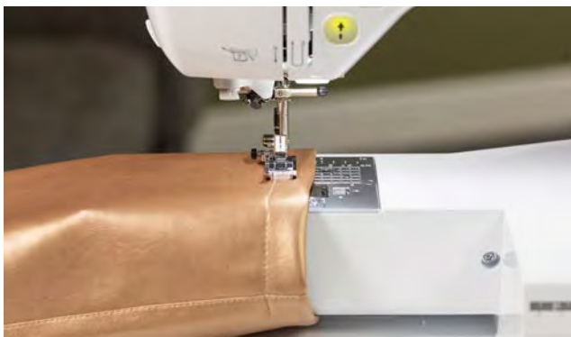
Free arm sewing