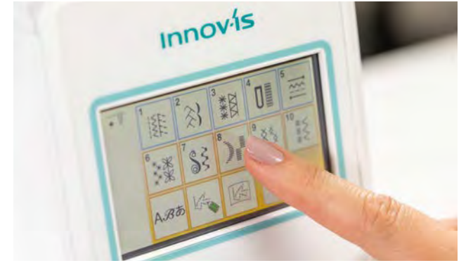
Colour LCD touchscreen