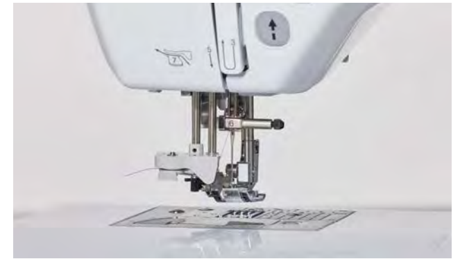
Advanced needle threader