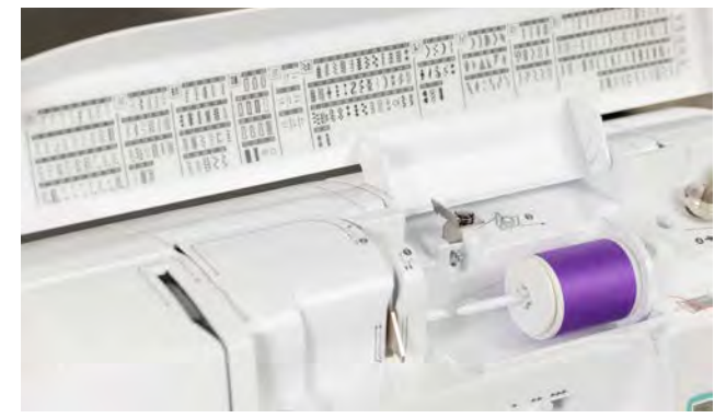
241 built-in sewing and decorative stitches